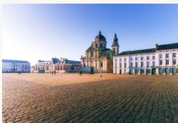
Sint-Pietersabdij Sint-Pietersplein 9, 9000 Gent Oral and poster presentation