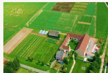
Experimental Farm Bottelare Diepestraat 1, 9820 Merelbeke Field demonstration